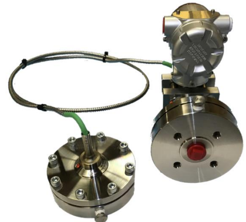
Haygor Temperature Compensated Seal System for DP Measurement (Patent Pending)

We’ve been providing solutions to the Petrochemical, Oil & Gas, and Cryogenic industries for over 40 years. We think differently than the rest of the industry and believe we can help find the right solution for you.